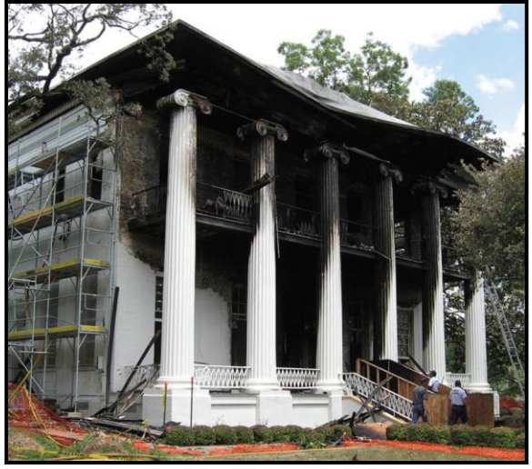
Texas Governor's Mansion after the fire