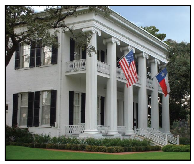
Texas Governor's Mansion before the fire.