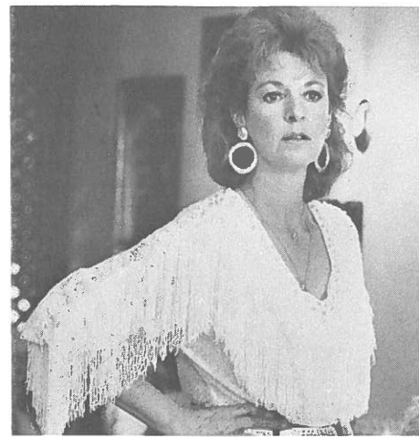
Jane Alexander as Juanelle King, a hairdresser from Fort Worth in Square Dance .