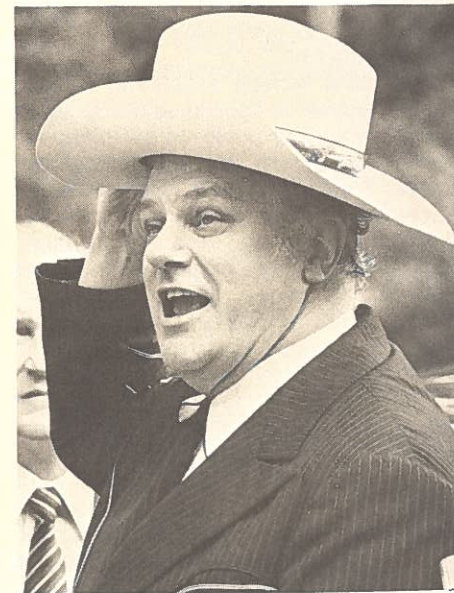
Charles Durning plays a Texas governor determined to "side-step" the issues.