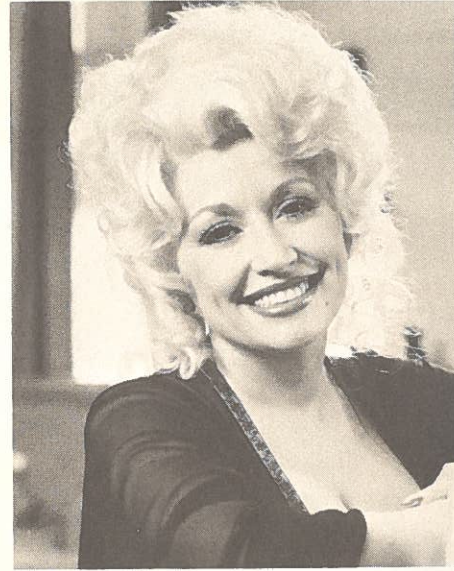
Miss Mona is portrayed by Dolly Parton.