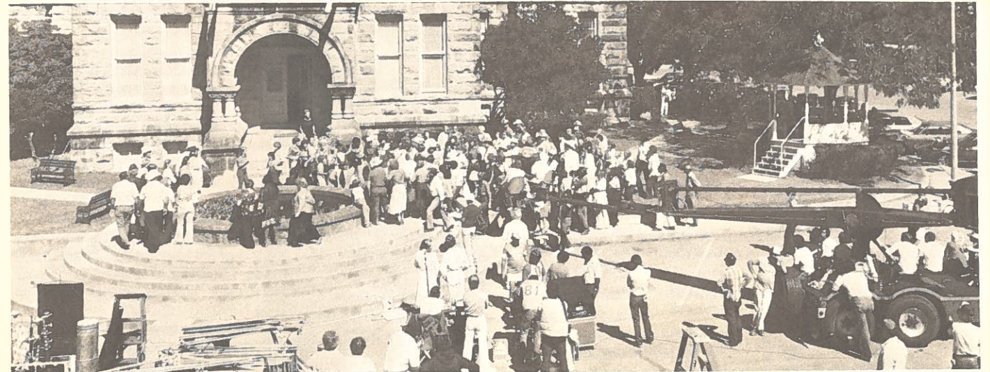
The Lavaca County Courthouse in Hallettsville, above, served as the location where Sheriff Ed Earl punches out media zealot Melvin P. Thorpe. The lily pond where Thorpe takes an ill-timed plunge was specially constructed for the filming of BEST LITTLE WHOREHOUSE IN TEXAS , and was later removed.