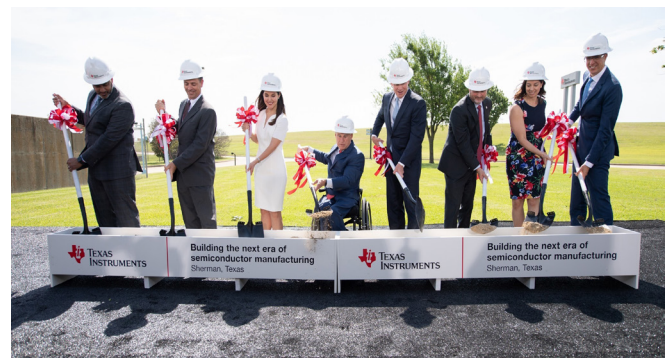
Governor Greg Abbott participated in the groundbreaking ceremony for TI's new 300-mm semiconductor wafer fabrication facilities in Sherman, Texas.

Texas is proud to be home to the headquarters of Texas Instruments (TI) in Dallas, as well as manufacturing and design facilities in Dallas, Richardson and Sherman. Notably, TI opened the world's first 300-millimeter (mm) analog wafer fab in Richardson in 2009, RFAB1, followed by initial production at a second 300-mm wafer fab in Richardson, RFAB2, in September 2022. Choosing Texas for continued expansion, TI announced the potential of up to four additional fabs at the company's site in Sherman. This landmark investment, which broke ground in May 2022, has the potential to create thousands of new jobs and up to $30 billion in capital investment over the coming decades.