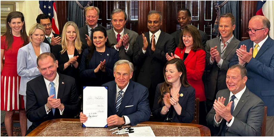
In June 2023, Governor Greg Abbott signed into law the Texas CHIPS Act (House Bill 5174), which will leverage Texas' investments in the semiconductor industry, encourage semiconductor-related companies to expand in the state, leverage the expertise and capacity at Texas higher education institutions and maintain Texas' position as the nation's leader in semiconductor manufacturing.

Samsung has had a strong presence in Texas for more than 25 years, dating back to 1996 when the company began construction on its first fabrication plant in Austin, Fab 1. The company's presence has since grown to include a second plant, Fab 2, built in 2007. Now with a new $17 billion fab underway in Taylor, and plans to increase their historic investment in Texas to include 11 additional semiconductor manufacturing facilities in Taylor and Austin, Samsung has fostered a remarkable legacy of innovation in Texas. Other top semiconductor companies in Texas include NXP, X-Fab, Tower Semiconductor, Qorvo, SecureFoundry, Infineon Technologies and more.