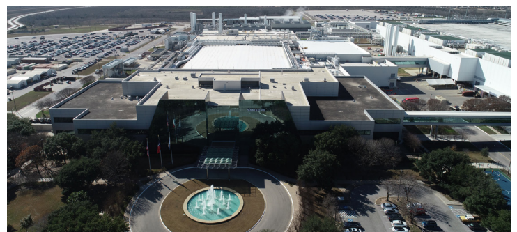
Samsung Austin Semiconductor is one of the most advanced fabrication facilities in the world.

Thanks to a powerful history in semiconductors and continued advancements in innovation, as well as incentives and initiatives leveraged through the Texas CHIPS Act, Texas will continue to strengthen the domestic semiconductor supply chain while building the technologies of tomorrow.