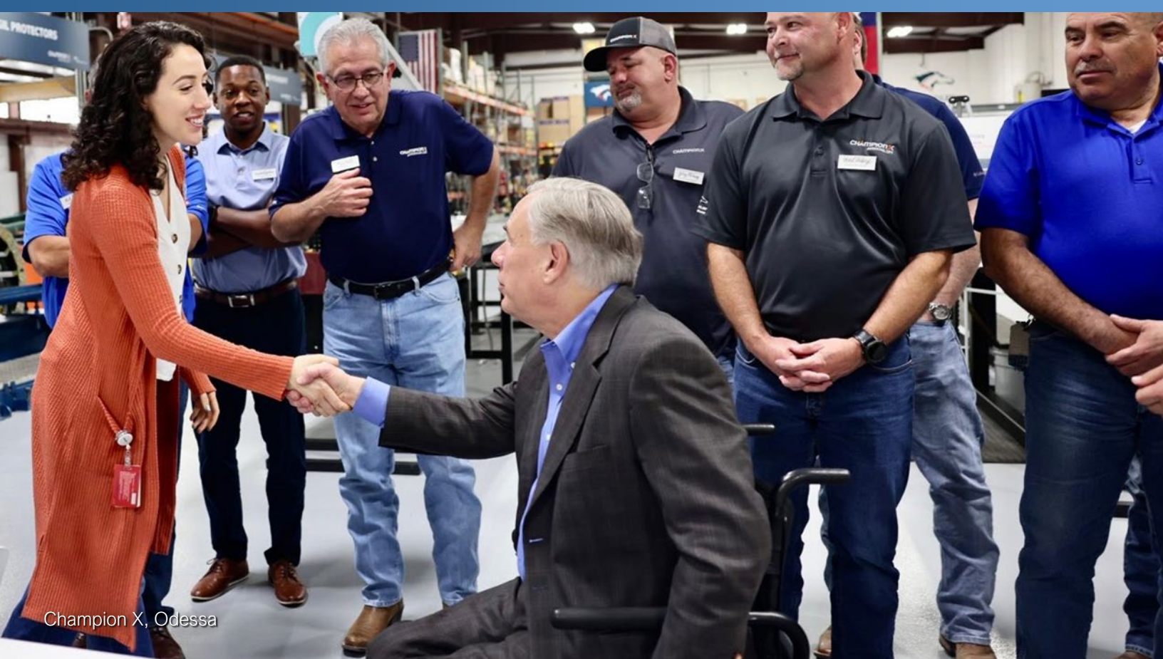
Champion X, Odessa