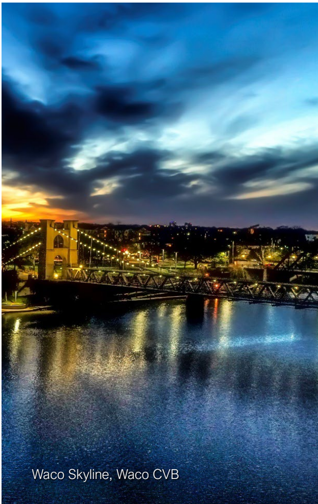
Waco Skyline

Local and regional economic development organizations across Texas are fundamental to our ongoing economic success, as they are best positioned to understand their communities' needs and to develop initiatives that align with their goals and unique advantages. They also provide tailored business assistance services that help companies find the locations, facilities, and workforce required to locate and expand within their region. However, not all local and regional economic development organizations in Texas have the capacity or tools required to effectively meet the needs of their communities. EDT will take the following actions to expand the effectiveness of Texas' local and regional economic development efforts.