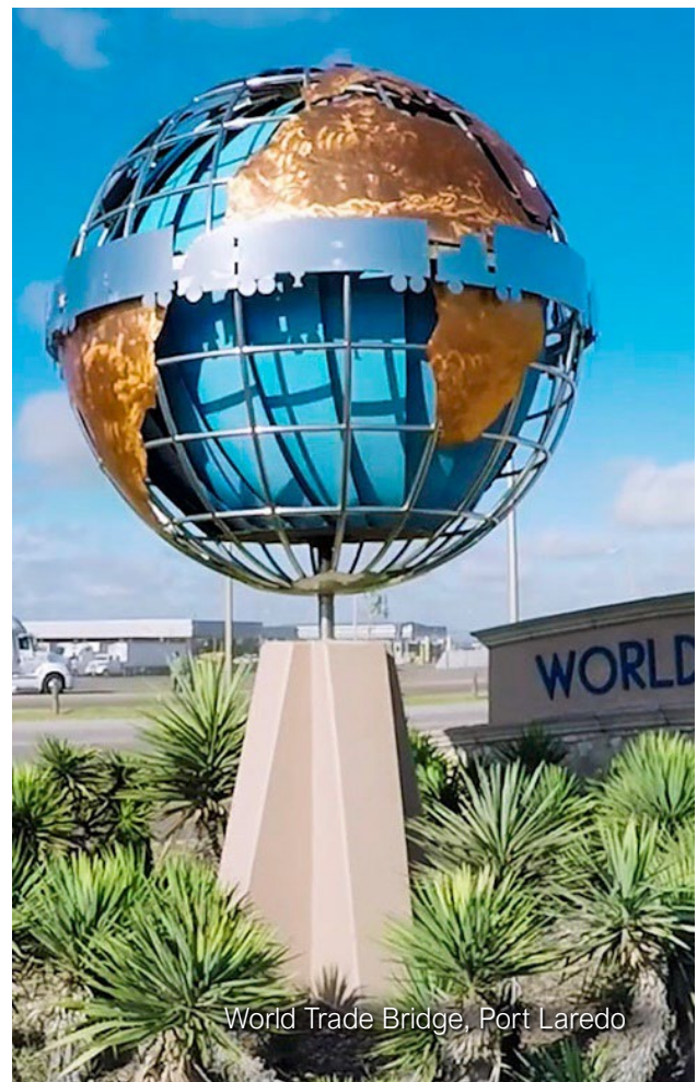
World Trade Bridge, Port Laredo

Connected through over 1,200 miles of common border stretching from the Gulf of Mexico to El Paso, Texas' partnership with Mexico is a key economic asset. To promote increased cross-border collaboration and accelerate our shared industry cluster growth, EDT will increase participation in international stakeholder groups, to include the International Bridges Steering Committee and the Border Trade Advisory Committee (BTAC).