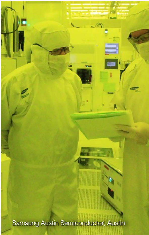
Samsung Austin Semiconductor, Austin