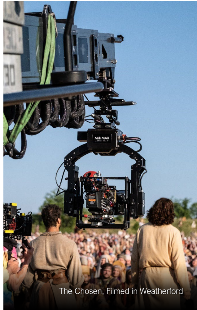
The Chosen, Filmed in Weatherford

Texas has established a portfolio of programs and incentives at the state and local levels aimed at growing and encouraging innovation within our target sectors. Many of these programs, such as TEF and the Texas Moving Image Industry Incentive Program (TMIIP), have already had a positive impact on sector business attraction and growth efforts. EDT will leverage and expand promotion of these incentives to drive innovation and growth within our target sectors and clusters.